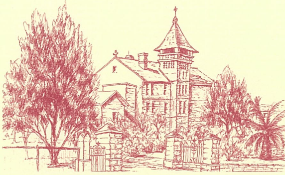
Holy Cross College, founded by the Patrician Brothers, 1891